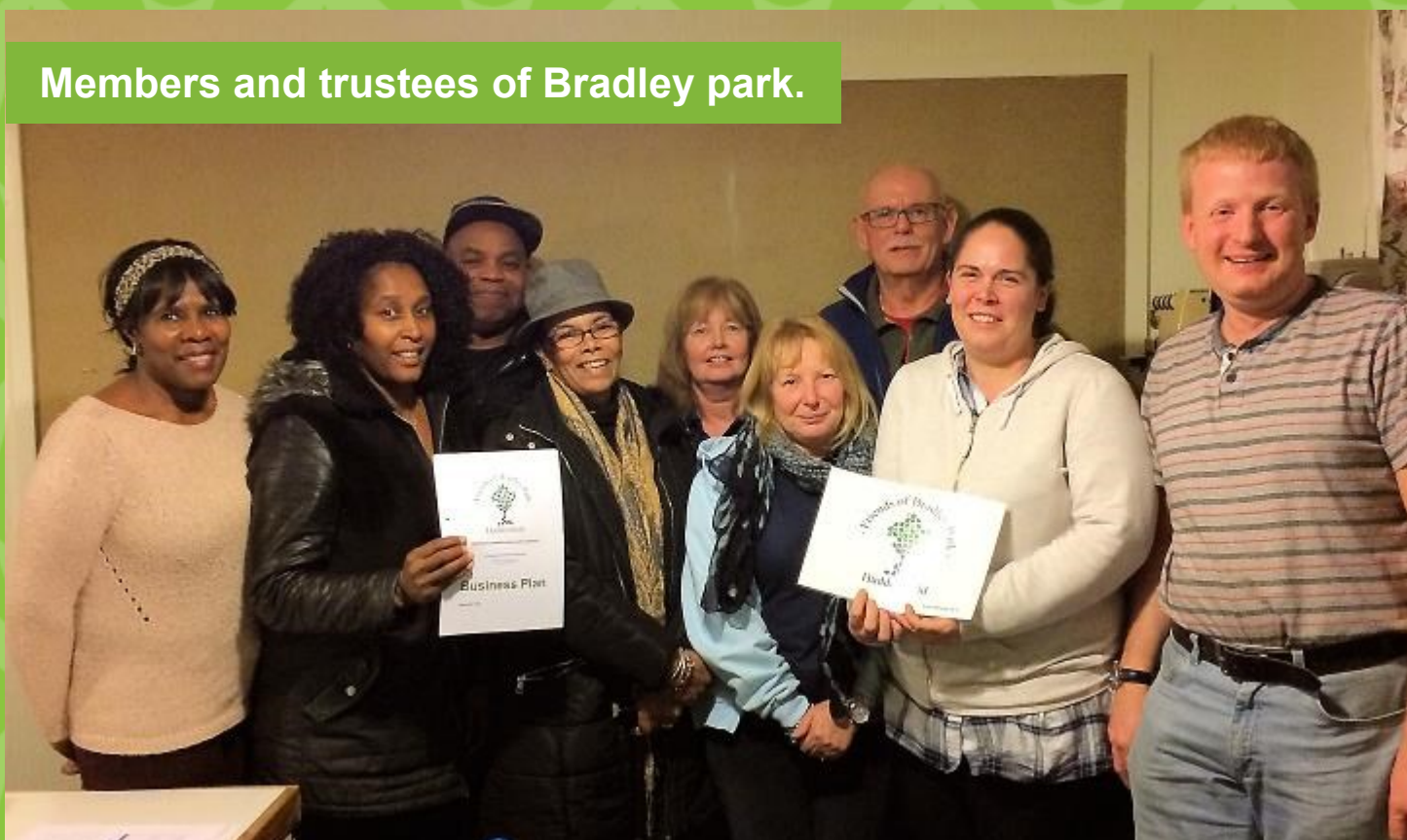
Members and trustees of Bradley park.

“Friends of Bradley Park members have approved a historic motion to sign the proposed 125 year lease with Kirklees Council and bring Bradley Park into community ownership. A preliminary date for the handover was set as the 18th of December. The vote was held at the Bradley TRA and represents a massive step towards a commitment to having Bradley Park run by the community for the community. Signing the lease will release significant funding for a new community building, offices, meeting room and changing facilities for which the group already has planning permission. The new facilities and extensive sports pitches will be rented to community groups on a not for profit basis to pay for park maintenance and improvements.”